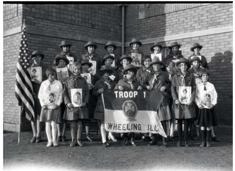
Girl Scouts Troop 1 of Wheeling Illinois in the 1920s