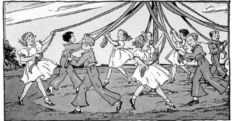
A school book illustration of children dancing around the Maypole.

And most importantly, Memorial Day is set aside in May to honor those who have defended the United States and paid the ultimate price for our freedom. ☺